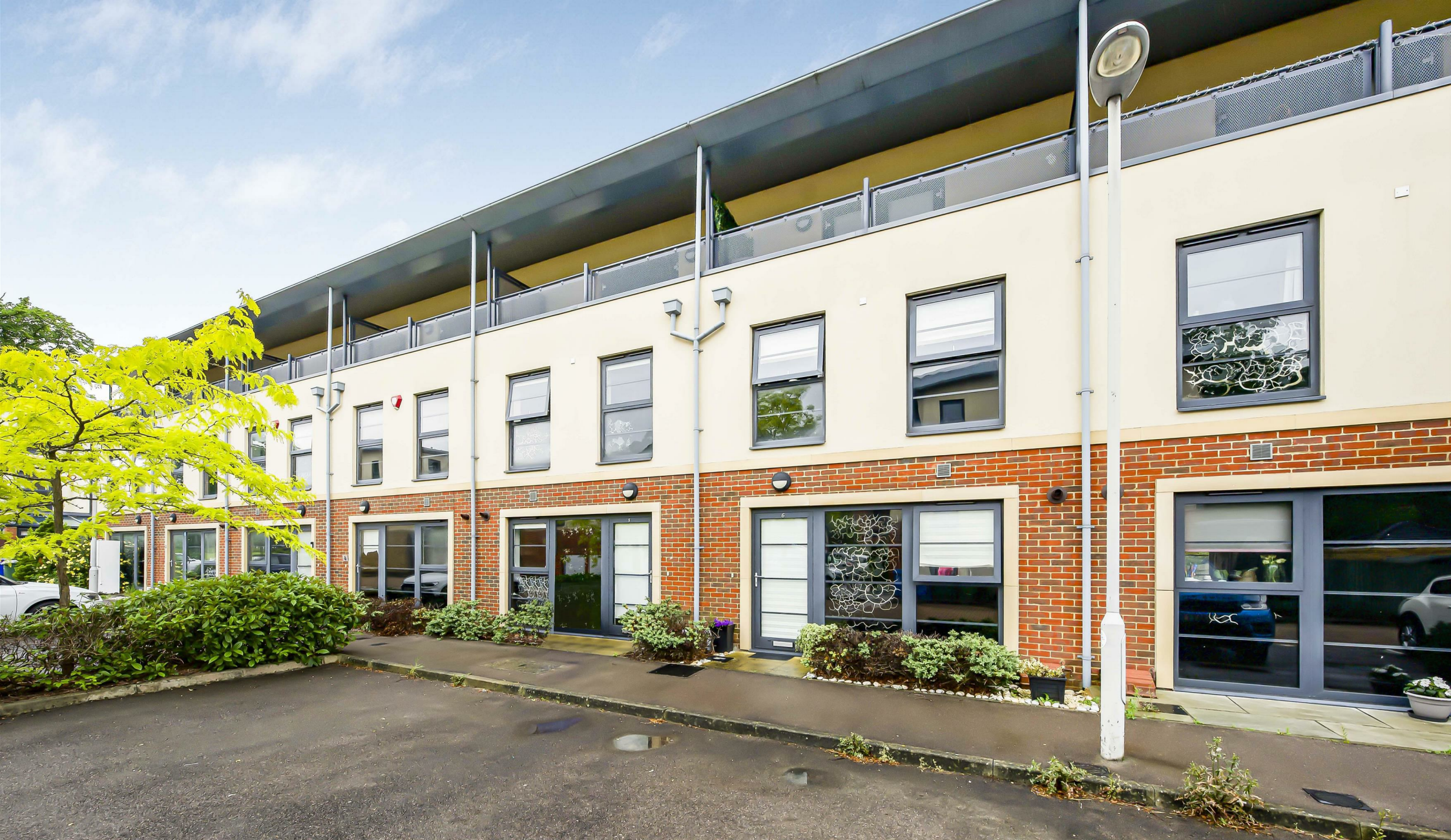
Jupiter Close, Farnborough